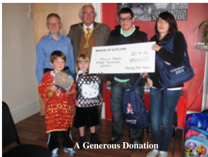
A Generous Donation