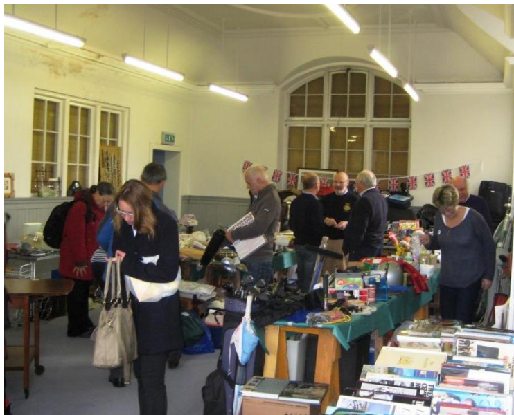
A Busy Charity Shop

Anyone looking for fun and fellowship is cordially invited to join us at the Sands on Tuesdays at 6.15.