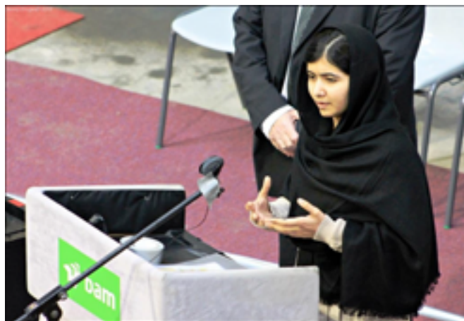
An Inspirational message