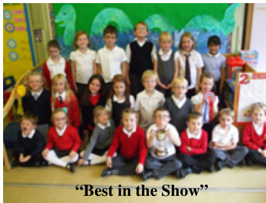
"Best in the Show"

under 12's and commendably, best exhibit in the Show. The children have a fine trophy to show for their hard work.